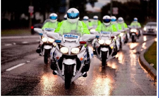
Recruitment Branch Facebook: NSW Police Recruitment Branch page where you have the ability to ask us questions 24/7.