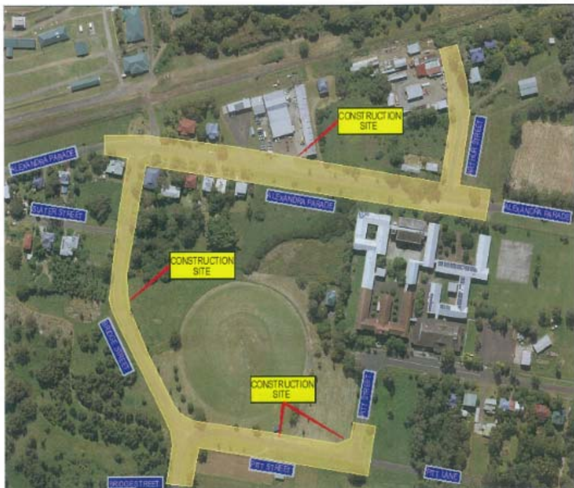
Map showing area affected by new water main – Alexandra Parade, Arthur, Bridge and Pitt Streets, North Lismore