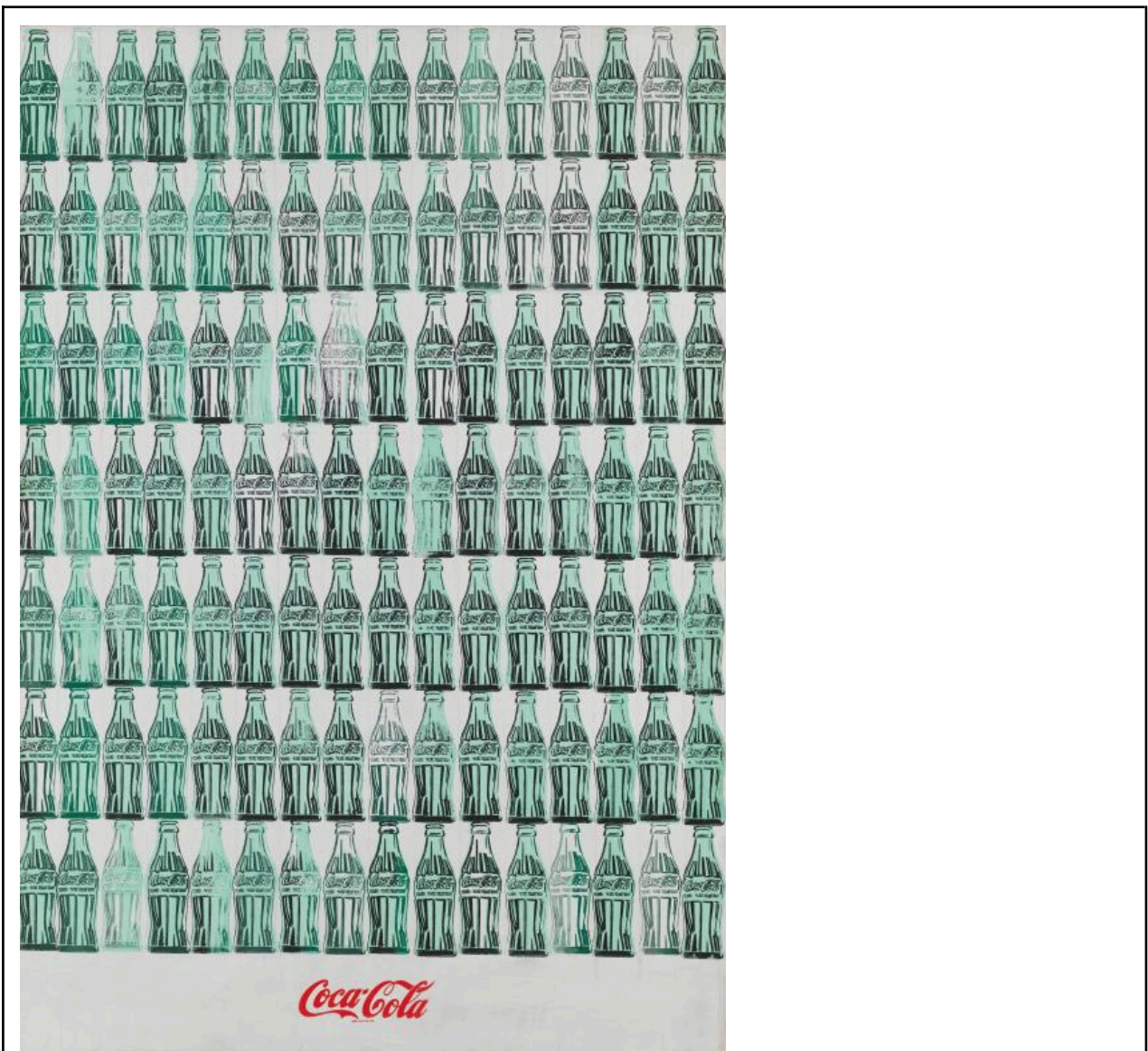
Andy Warhol, (American, 1928-1987) Green Coca Cola Bottles , 1962. Acrylic and screen print on canvas. 205.7 x 567.7cm

Use key terms and paragraph structure in your response.